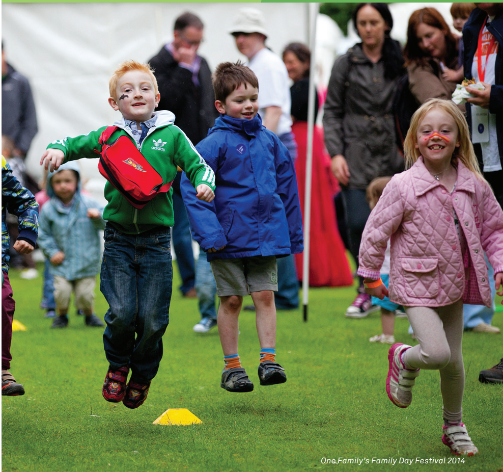
One Family's Family Day Festival 2014